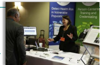
EXHIBIT MOVE IN